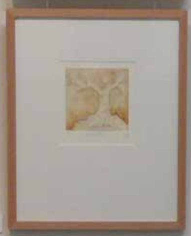
Small white label with text.