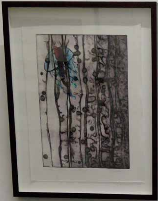
Artwork title and artist information.