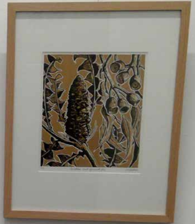
Artwork title and artist information.