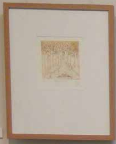
Small white label with text.