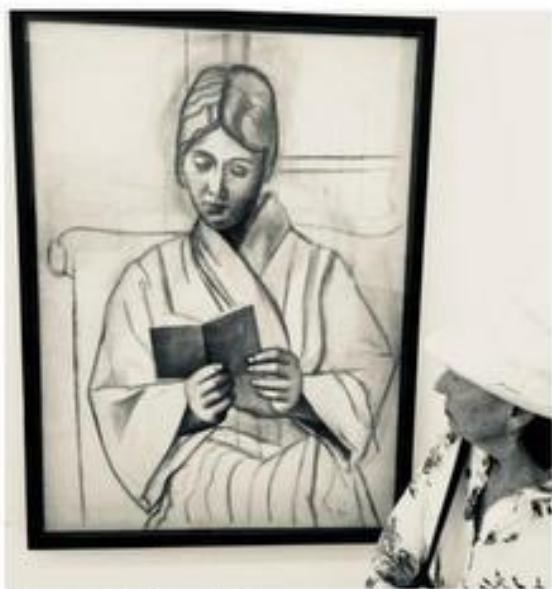
Olga Reading, 1920

In the 92 years of his life, Picasso was one of the most prolific artists of his century. It is estimated that he managed to produce around 70,000 works!