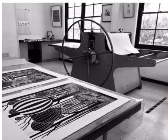
Work in situ