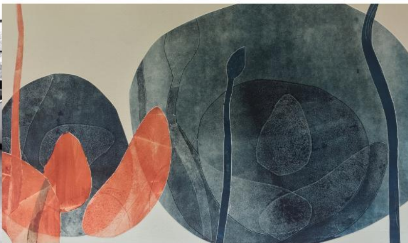
Jo Darvall Gold Lotus 2018 mono type