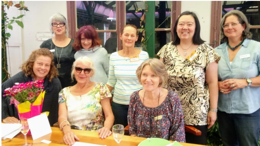
The new Committee for 2018-19 at the PAWA AGM 2018 at Tresillian Art Centre, Nedlands.