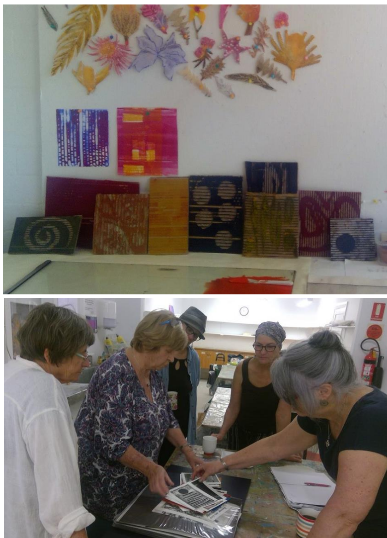
Top : some of the plates created at November's Skill Share.

10am to 2pm, PAWA Studio, usually the first Saturday every month