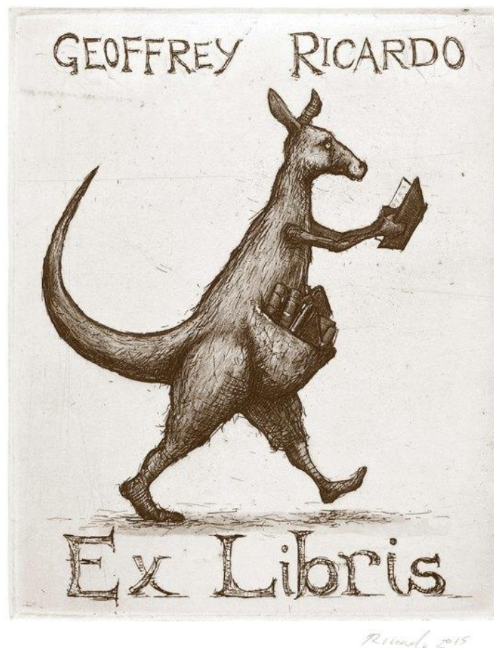
Illustration: Geoffrey Ricardo Bookplate for Himself Etching & Aquatint 126 x 101mm Winner 2015

The richest bookplate design award world wide