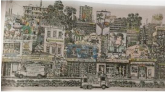
Where is my House? 2018