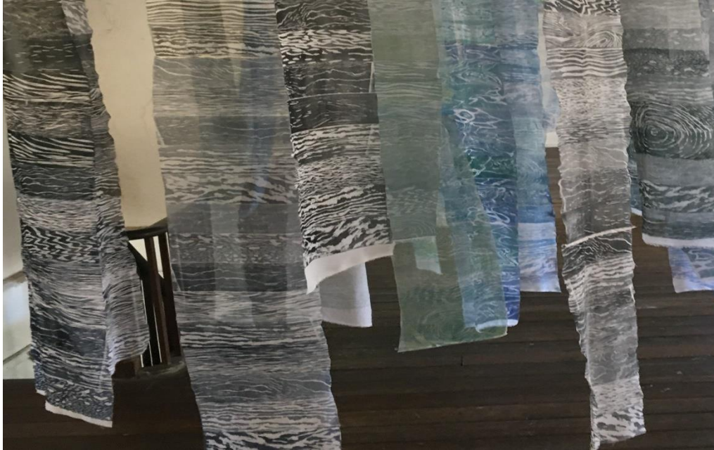
Photo: Ebb and Flow installation (detail) at PAWA's Bodies of Work Exhibition at Moores Building Contemporary Art Gallery.

10am to 2pm, PAWA Studio. We look forward to resuming in February 2022.