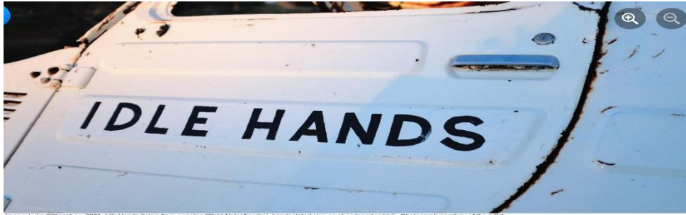
Image: Luke O'Donohoe, 2021, Idle Hands (taken from ongoing "Field Notes" series), handpainted sign on abandoned vehicle.