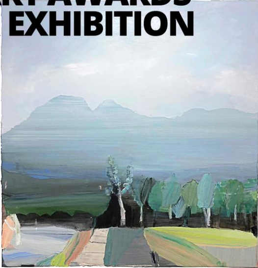
JANE TANGNEY, KOI KYEULU-RUFF (STIRLING RANGE) 2021 ART AWARD WINNER 12/08 - 27/08