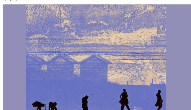
Image: Barbara Pierce, Group (detail), 2022, Inkjet print on Hahnemuele, 10.5 x 10.5cm (12 x 12cm paper).