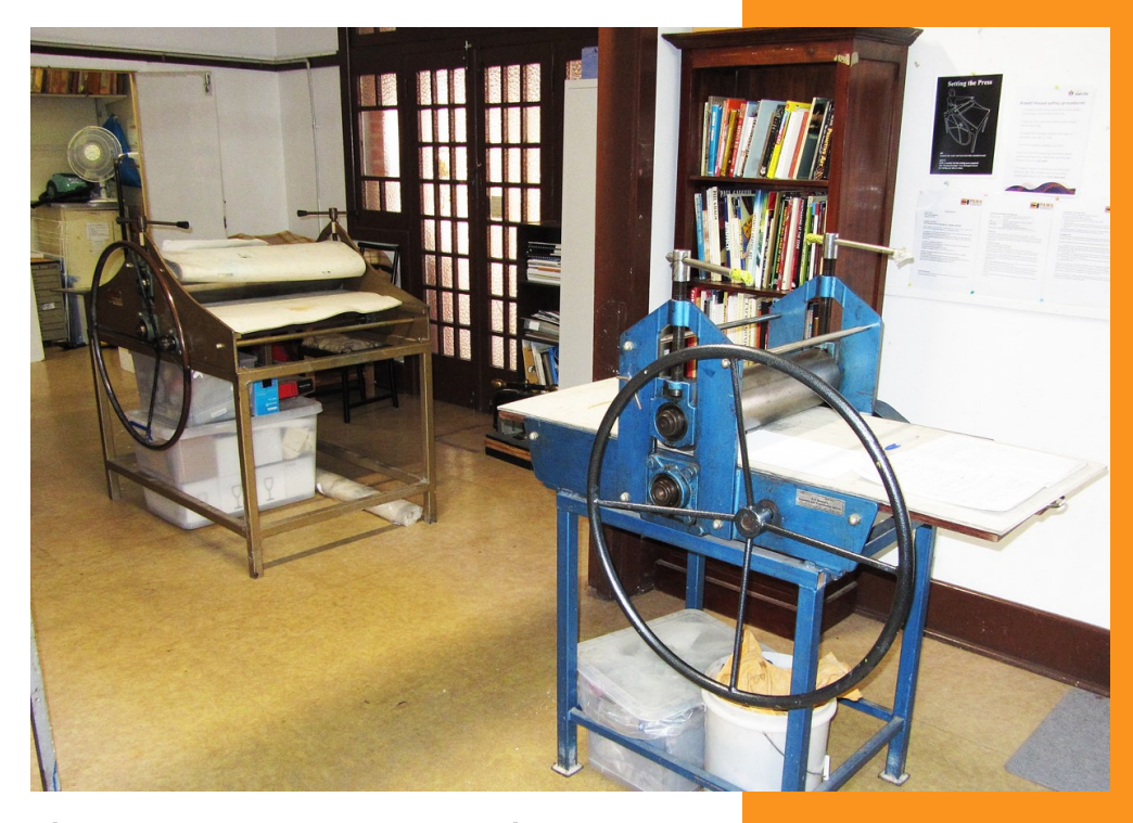
[PAWA presses.]