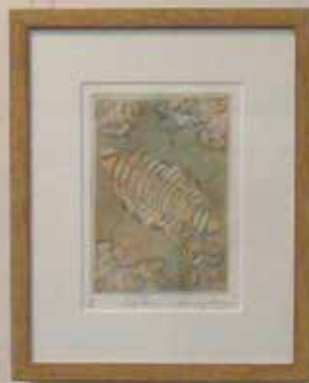
Small white label with text.