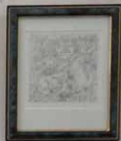
Small white label with text.